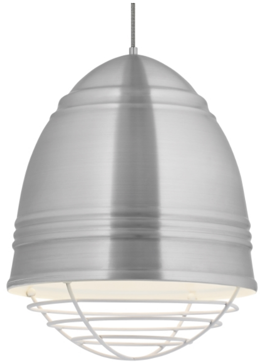
Brushed Aluminum White Cage