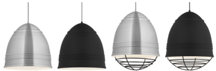
Brushed Aluminum w/ White Interior

Rated for (3) 75 watt E26 medium base lamps (Not included). LED includes (3) 120 volt 9.5 watt, 1461.2 delivered lumens 90 CRI 2700K LED A19 lamps. Dimmable with most LED compatible ELV and TRIAC dimmers. Brushed Aluminum includes 6 feet of black/white field-cuttable cloth cord. Rubberized Black includes 6 feet of field-cuttable black cloth cord. Rubberized White includes 6 feet field-cuttable black/white cloth cord.