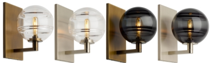
Clear / Aged Brass

Rated for (1) 5w max, E12 candelabra base lamps (Not Included). LED version includes (1) 2 watt, 155 delivered lumens, 2700K, E12 base LED vintage tubular lamp. Mounts up or down.