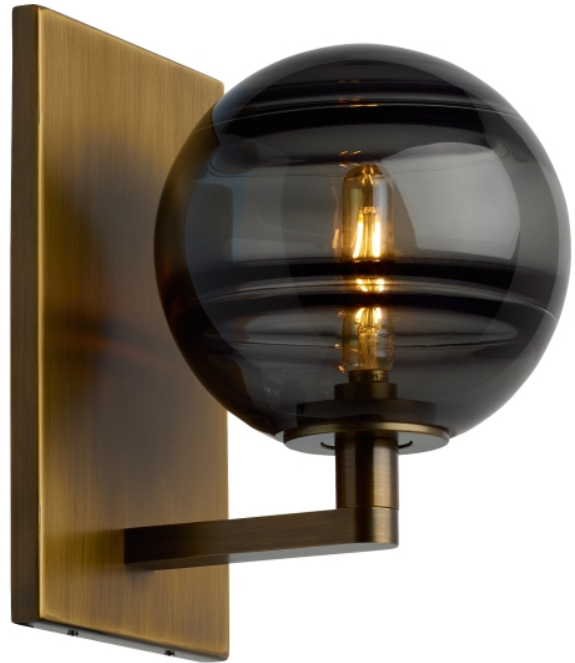
Smoke / Aged Brass