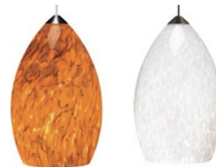
Tahoe Pine Amber

Includes low-voltage, 50 watt halogen bi-pin lamp or 8 watt, 300 delivered lumen, 3000K, replaceable SORAA® LED module and six feet of field-cutable cable. Dimmable with low-voltage electronic or magnetic dimmer (based on transformer).