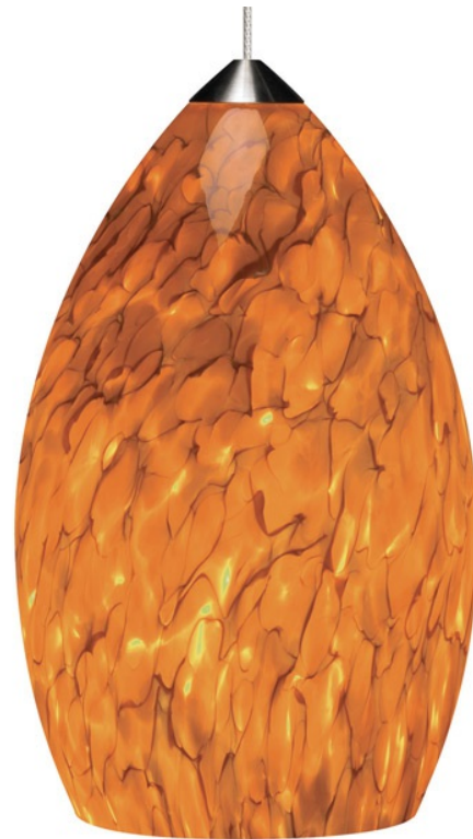
Tahoe Pine Amber