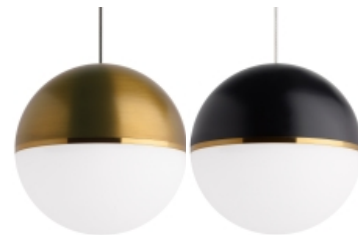
Aged Brass Bright Brass