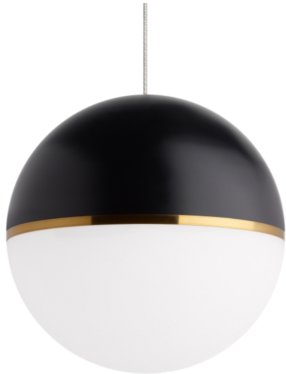
Matte Black Aged Brass