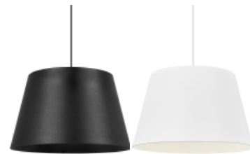
Textured Black / Black