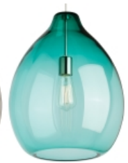
Surf Green Incandescent