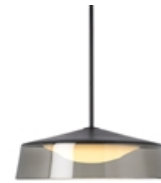
Smoke / Black