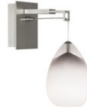
Satin Nickel shown with Alina (not included)

The integrated telescoping arm accommodates any pendant under 7.5 inches in diameter. The Ensú wall canopy can mount to either a 4" square electrical box with round plaster ring or an octagonal electrical box (not included). Includes low-voltage electronic transformer. Halogen version dimmable with a standard incandescent dimmer. LED version dimmable with a low-voltage electronic dimmer.