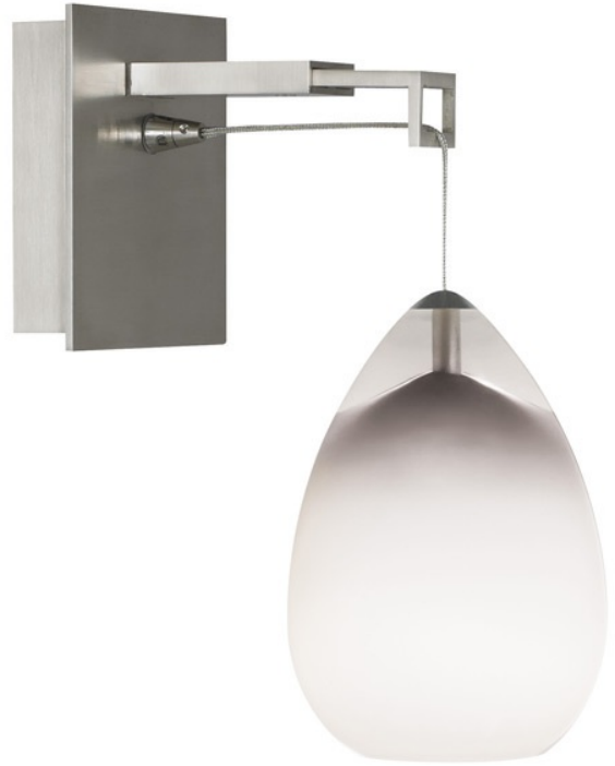
Satin Nickel shown with Alina (not included)