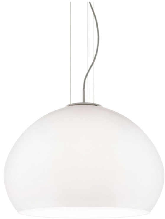
Gray Cord Grande