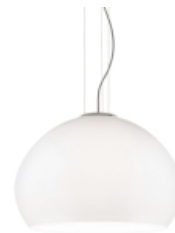
Gray Cord Grande