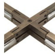
MonoRail X Connector