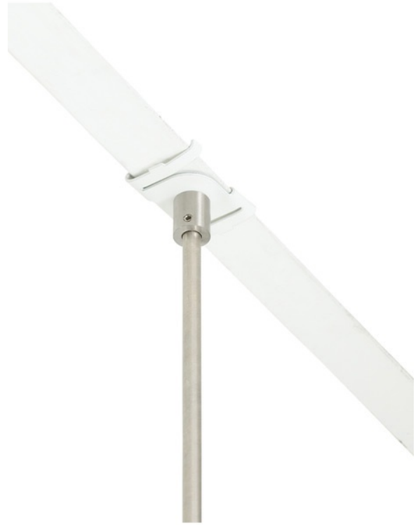
MonoRail T-Bar Connector