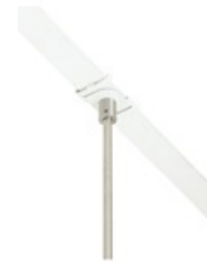
MonoRail T-Bar Connector

The T-bar clip twists into the slat. (Use only if local electrical codes allow). Specify 15/16" or 9/16" slat.