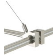
MonoRail Support Outside Rigger