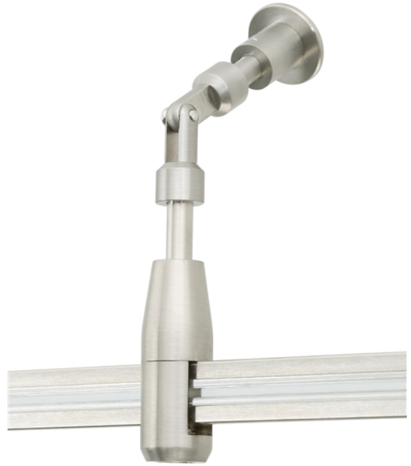
MonoRail Standoff Vault Adapter

Installs between the rigid or adjustable standoff (sold separately) and the ceiling to position rail parallel to the floor. Includes several rod lengths to achieve the proper pitch when used with a surface transformer.