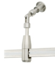
MonoRail Standoff Vault Adapter