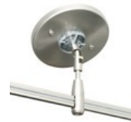
MonoRail Power Vault Adapter