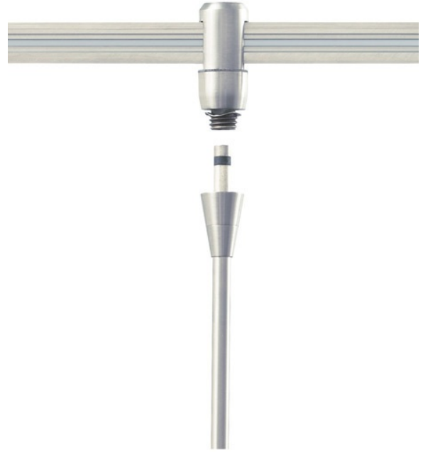
MonoRail FreeJack Connector