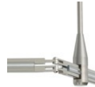
MonoRail Flexible Connectors