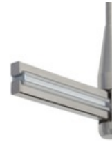
MonoRail End Caps