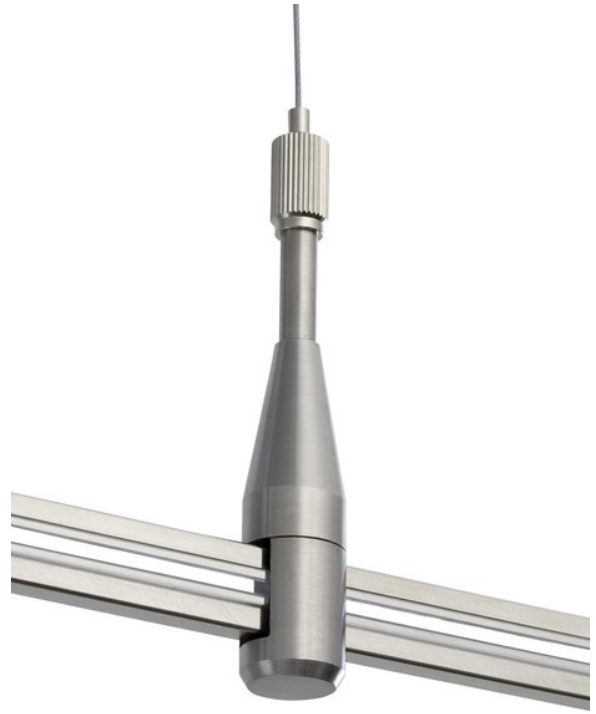
MonoRail Adjustable Standoff

It is best used on fairly straight runs with a drop greater than 6". A wire grip allows you to easily shorten or lengthen the cable to size it for use. Use standoff supports every three feet of MonoRail run and at corners. Standoffs can be positioned to cover points where rails are joined.