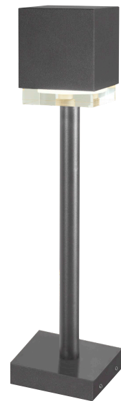
VOTO 18 PATH shown in charcoal