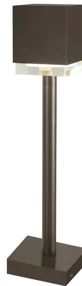
VOTO 18 PATH shown in bronze