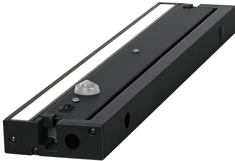
BLACK WITH OCCUPANCY SENSOR (SHOWN ON)