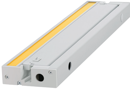
WHITE (SHOWN OFF)