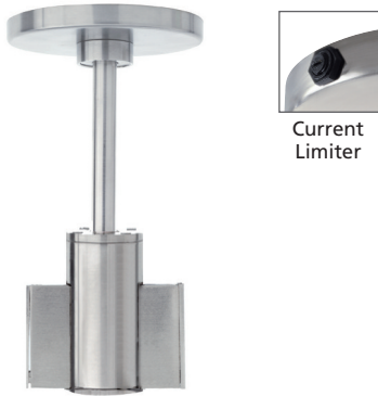
Shown approximately 20% actual size.