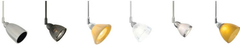
with bell accessory with mesh tinkerbell shield accessory with onyx cone accessory with prism glass shield accessory with round glass shield accessory with soda glass shield accessory