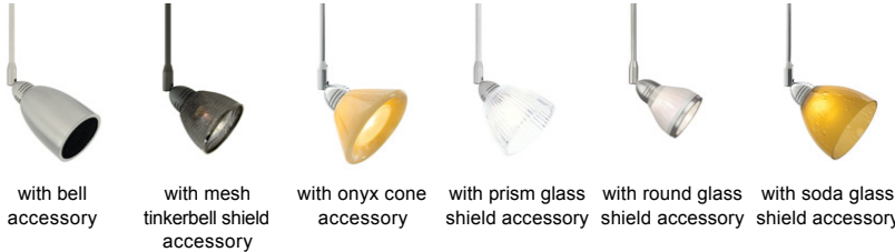
with bell accessory with mesh tinkerbelle shield accessory with onyx cone accessory with prism glass shield accessory with round glass shield accessory with soda glass shield accessory