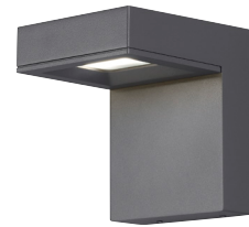
TAAG 6 shown in charcoal