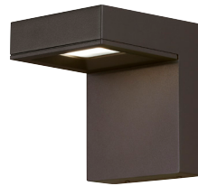
TAAG 6 shown in bronze

* Visit techlighting.com for specific warranty limitations and details.