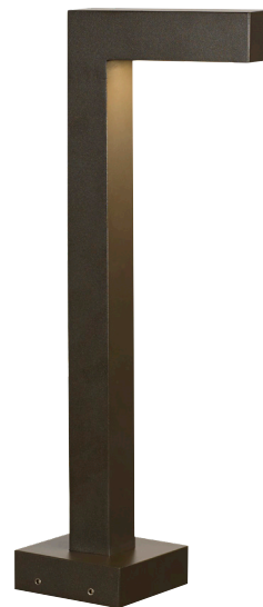
STRUT PATH shown in bronze

* Visit techlighting.com for specific warranty limitations and details.