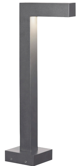
STRUT PATH shown in charcoal