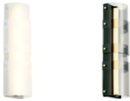
frost / satin nickel smoke / black