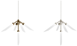
frost / aged brass frost / satin nickel