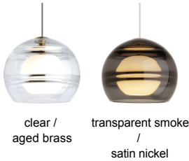
clear / aged brass