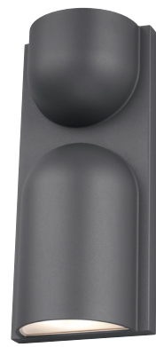
SAVINO 2 SMALL shown in charcoal