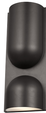
SAVINO 2 SMALL shown in bronze

* Visit techlighting.com for specific warranty limitations and details.