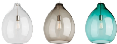
clear incandescent smoke incandescent surf green incandescent