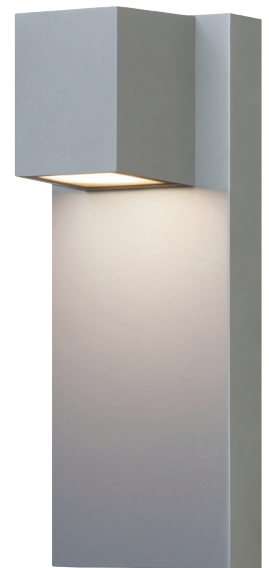
QUADRATE shown in silver