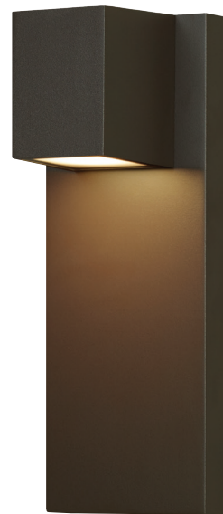
QUADRATE shown in bronze

* Visit techlighting.com for specific warranty limitations and details.