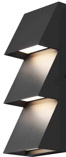
PITCH TRIPLE shown in black

* Visit techlighting.com for specific warranty limitations and details.