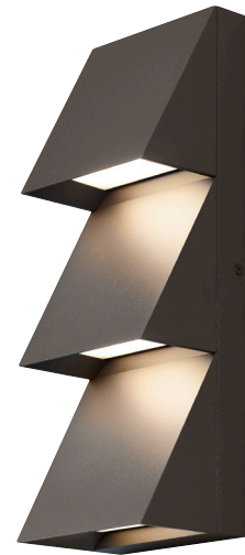
PITCH TRIPLE shown in bronze