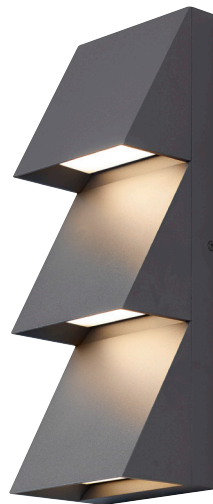
PITCH TRIPLE shown in charcoal