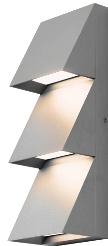
PITCH TRIPLE shown in silver