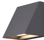
PITCH SINGLE shown in charcoal