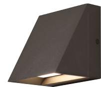
PITCH SINGLE shown in bronze