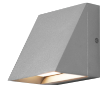
PITCH SINGLE shown in silver