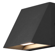
PITCH SINGLE shown in black

* Visit techlighting.com for specific warranty limitations and details.