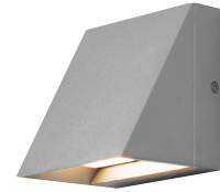
PITCH SINGLE shown in silver