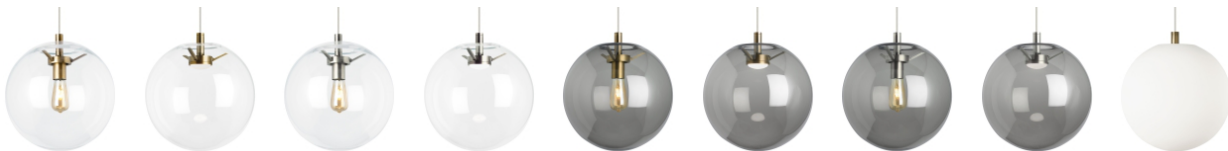
clear / aged brass incandescent clear / aged brass led clear / satin nickel incandescent clear / satin nickel led smoke / aged brass incandescent smoke / aged brass led smoke / satin nickel incandescent smoke / satin nickel led white / aged brass

This product can mount to either a 4" square electrical box with round plaster ring or an octagon electrical box.