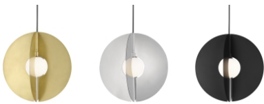
brass polished nickel matte black

This product can mount to either a 4" square electrical box with round plaster ring or an octagon electrical box.