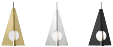
brass polished nickel matte black

This product can mount to either a 4" square electrical box with round plaster ring or an octagon electrical box.