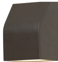
NEUTRINO shown in bronze