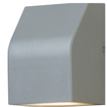
NEUTRINO shown in silver