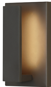
NATE 09 shown in bronze

* Visit techlighting.com for specific warranty limitations and details.