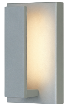
NATE 09 shown in silver