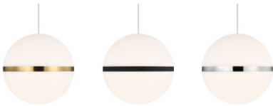
natural brass nightshade black satin nickel