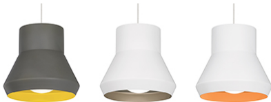
gray/chartreuse white/champagne white/orange