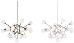
frost / aged brass frost / satin nickel