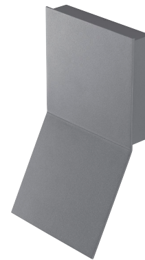
LEE V shown in charcoal