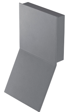
LEEV shown in charcoal