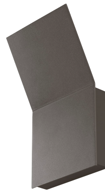
LEE V shown in bronze

* Visit techlighting.com for specific warranty limitations and details.