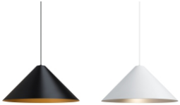
black / satin gold white / satin haze