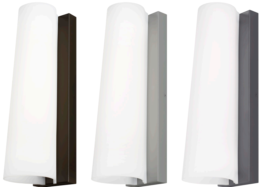
KONIAL 17 shown with diffuse shade, bronze

* Visit techlighting.com for specific warranty limitation and details.