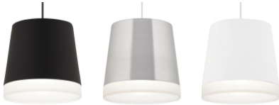
black brushed aluminum white