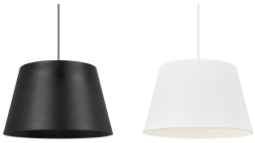
textured black / black