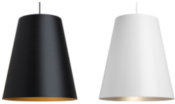
black / satin gold white / satin haze