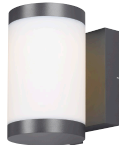
GAGE 8 shown in charcoal