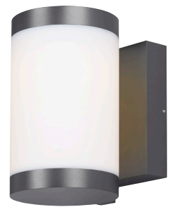
GAGE 8 shown in charcoal