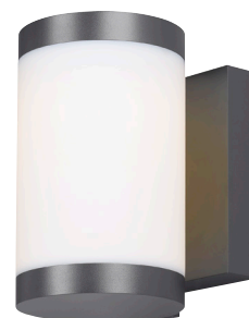
GAGE 8 shown in charcoal