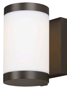
GAGE 8 shown in bronze

* Visit techlighting.com for specific warranty limitations and details.