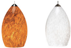
tahoe pine amber