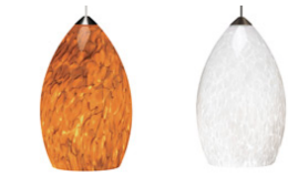
tahoe pine amber