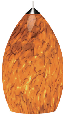
tahoe pine amber