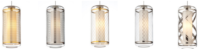
clear-polished gold lattice clear-polished platinum lattice clear-polished gold moroccan clear-polished platinum moroccan clear-polished platinum plaid