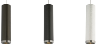
brown chestnut weathered gray oak white ash