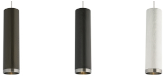
brown chestnut weathered gray oak white ash